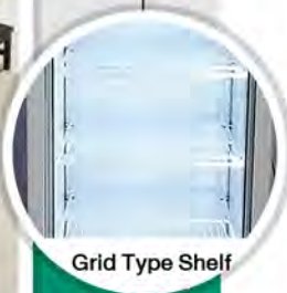
Grid Type Shelf