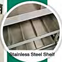
Stainless Steel Shelf